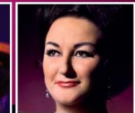
From top left, clockwise: Tom Jones, Birgit Nilsson, Peter Pears tenor, Cleo Laine, David Bowie, Kathleen Ferrier, Enrico Caruso, Katherine Jenkins, Freddie Mercury of Queen, Montserrat Caballe, Jon Anderson of Yes, Marilyn Horne, Luciano Pavarotti, Barbra Streisand, James Bowman counter-tenor, Kiri Te Kanawa, Frank Sinatra, Ella Fitzgerald